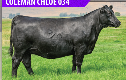
The $150,000 Full Sister.