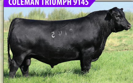
The $450,000 Full Brother.