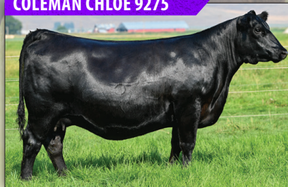
The $750,000 Full Sister.