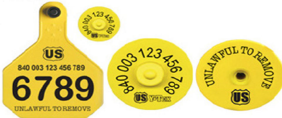
Visual and RFID 840-tag