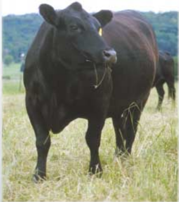
Cody uses expected progeny differences (EPDs) to improve his herd. He also develops balanced feeding rations. "When you feed and care for your cattle sufficiently, your cattle will be in better shape, produce a better product and reach market weights at an earlier date," he says.